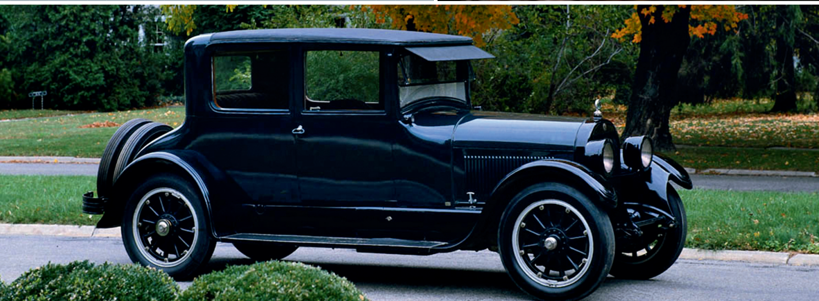
Plain bearings for all combustion engines and industrial facilities of every age